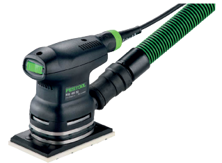
Vlakschuurmachines RTS 400 EQ-Plus 230V - FS-574634