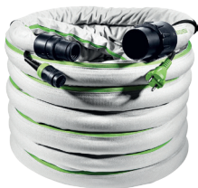
Afzuigslang D32/22x10 AS-GQ FS-500281