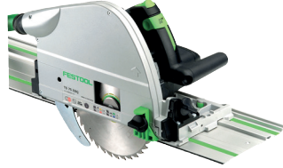
Invalcirkelzaag TS 75 EBQ-Plus 0070-5075