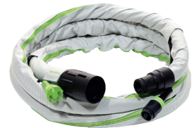
Afzuigslang D27/22x3,5 AS-GQ FS-500269