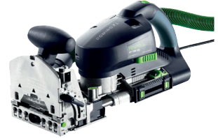
DOMINO verbindingsfrees XL DF 700 EQ-Plus - FS-574320