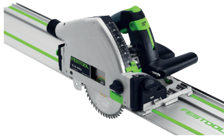
Invalcirkelzaag TS 55 REBQ-Plus-FS FS-561580