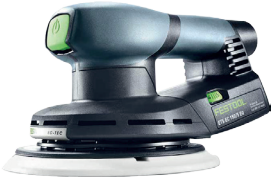
Excenterschuurmachine ETS EC 150/5 EQ-Plus - FS-571882