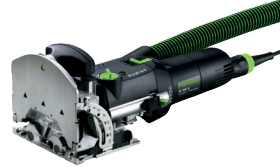
DOMINO verbindingsfrees DF 500 Q-Set - 0070-3500