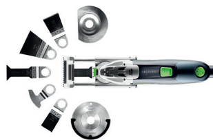
Oscillerende VECTURO OS 400 EQ-Set FS-563001

MEER INFO KAN MEN VINDEN OP ONZE WEBSITE.