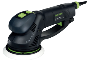
Excenterschuurmachine ROTEX RO 150 FEQ-Plus - 0070-9011