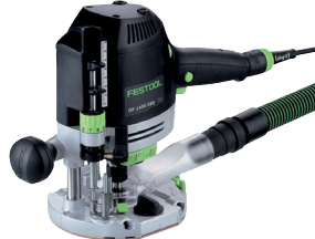
Bovenfrees OF 1400 EBQ-Plus 0070-3014