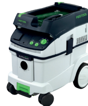
Mobeile stofzuigers CLEANTEX CTL 36 E AC FS-584025