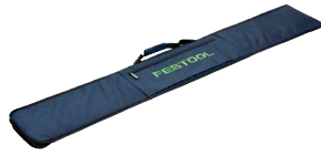
Draagtas FS-BAG 0073-3920