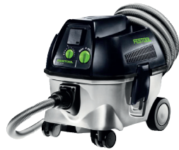
Mobeile stofzuiger CLEANTEX CT 17 E FS-768944